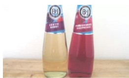
Jagoff of the Week: People Who Grew Up On Wine Coolers Jagoffs November 15, 2015 In "Article"